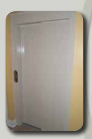
Beige Epoxy Sliding Door