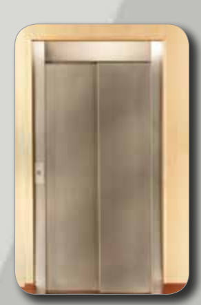
Custom Color Sliding Door Stainless Steel Sliding Door (Optional)

Please refer to our "Options" brochure for a complete list of finishes and optional choices.