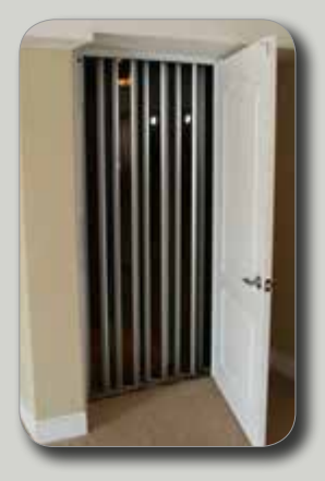
Visifold Accordion Gate (Optional)